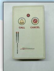
Wearable pendant Wb1