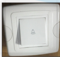
Wall mounted Call switch Cb1