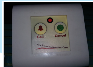
Bed side unit Bm1