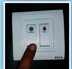
Bed side unit Bs1