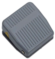
Foot operated Fb1

Bed Unit & Handset : The Bed Unit is located near the patient bed. The unit has CALL, WAIT, BLUE CODE and RESET buttons and female socket to attach the Handset. The Bed Side Unit has battery for wireless models.